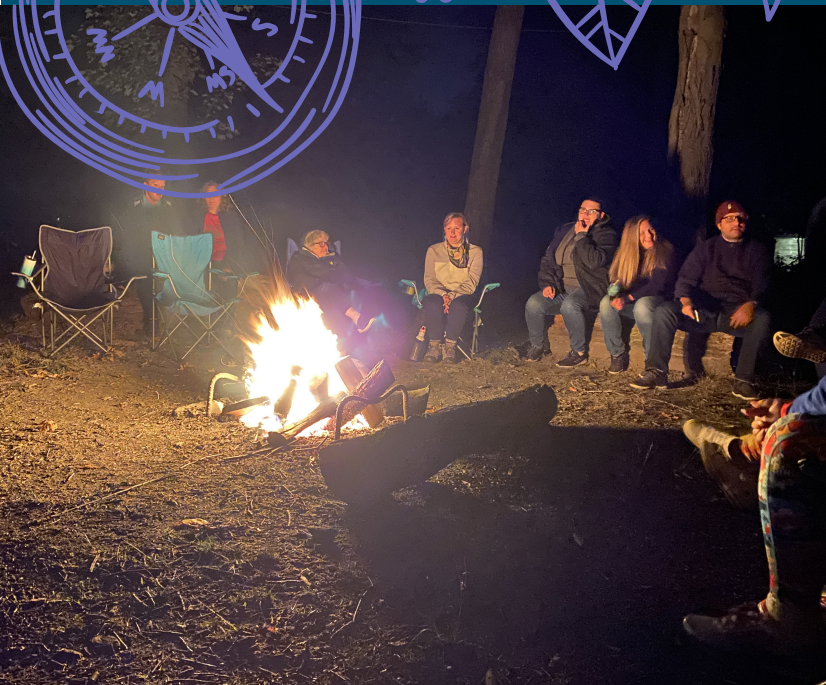
2022 Grown Up Camp