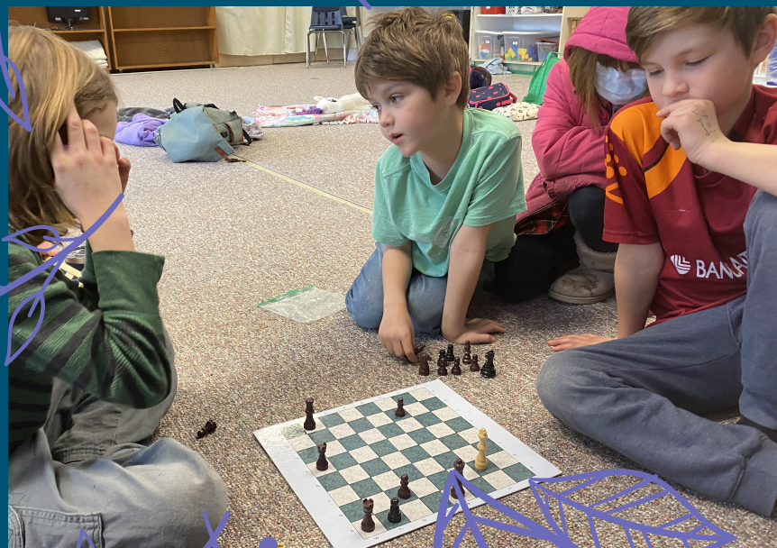
Good Shepherd Montessori Extended Day