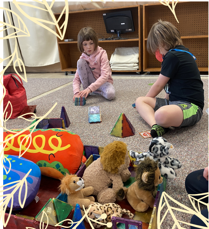
Good Shepherd Montessori Extended Day