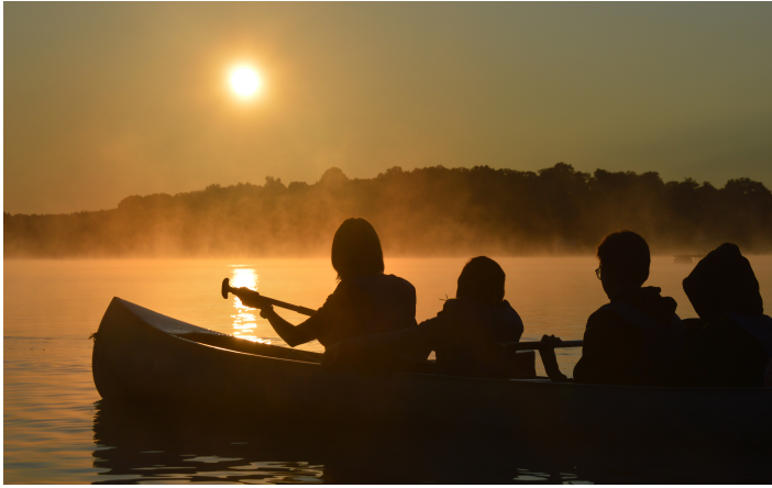
Early Morning on Birch Lake