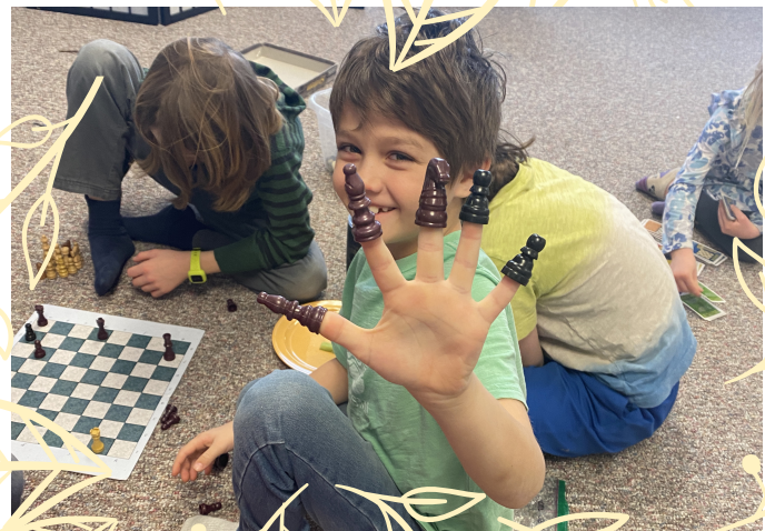
Good Shepherd Montessori Extended Day

Both of our school programs were back up and running this year, for the entire school year. And Camp Tannadoonah served a record 1208 campers this summer!