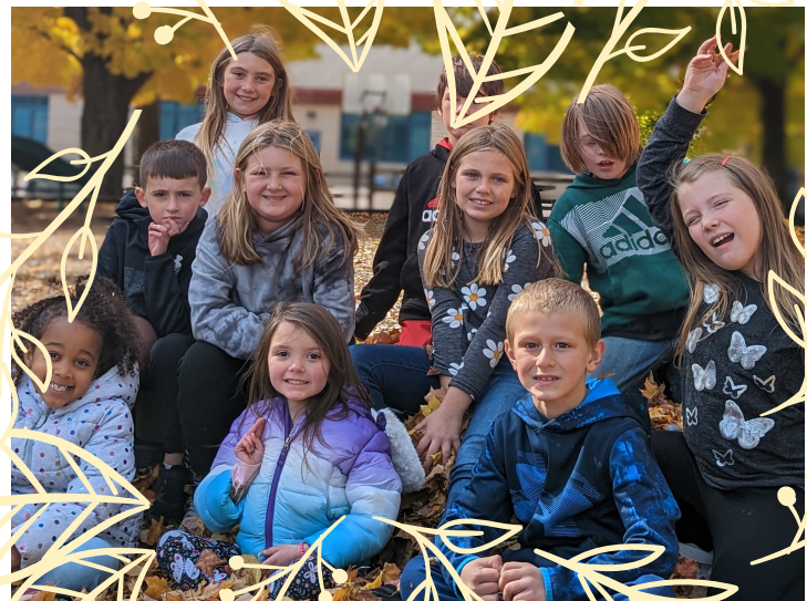
After School at Sam Adams Elementary

Contributions may be unrestricted, or designated for camperships, programs, or facilities.