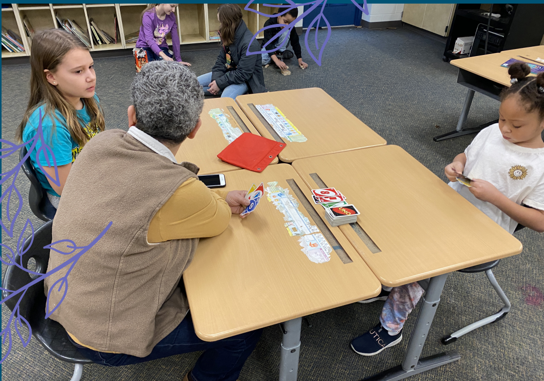
After School at Sam Adams Elementary