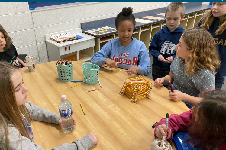
After School at Sam Adams Elementary